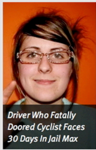
Driver Who Fatally Doored Cyclist Faces 30 Days In Jail Max